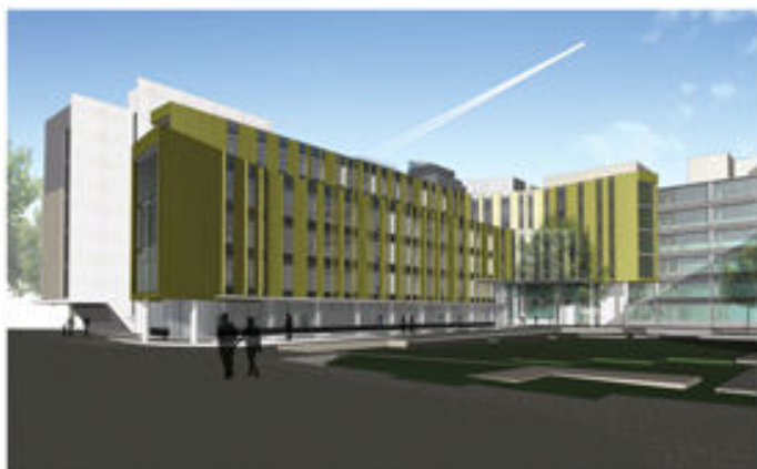
Artist's Impression of the Lowy and Wallace Wurth Buildings, completed by 2009

And though naturalists may have their concerns, the building's design principles also aim to make it environmentally friendly. It is also hoped to achieve a 5 Green Star Rating.